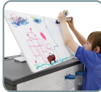
98-408-896 VESA MOUNT WHITEBOARD